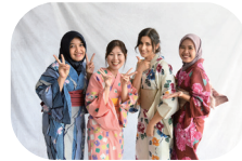
2023 SUMMER FESTIVAL