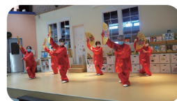
Tai Chi demonstrations (2021 Christmas party)

Events will include dances/songs from various countries, Ningyo Joruri puppet theater performances, and Tai Chi demonstrations