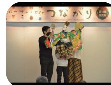
Ningyo Joruri puppet theater performances (2022 Christmas party)

Foreign residents will be able to wear Awa Odori yukata/costumes and enjoy the event