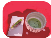
Tea Ceremony (2023 SAKURA FESTIVAL)